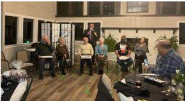
The "Not So Newlywed Game"